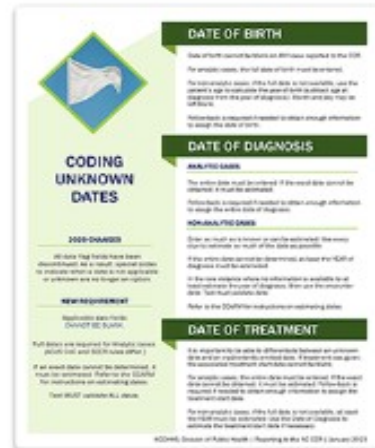
Coding Unknown Dates