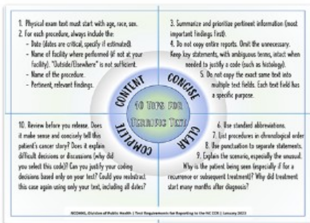
10 Tips for Terrific Text