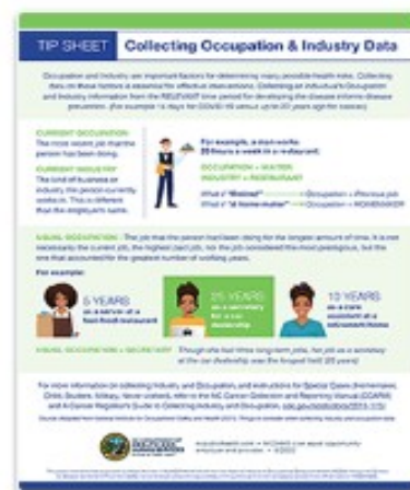
Collecting Occupation and Industry Data